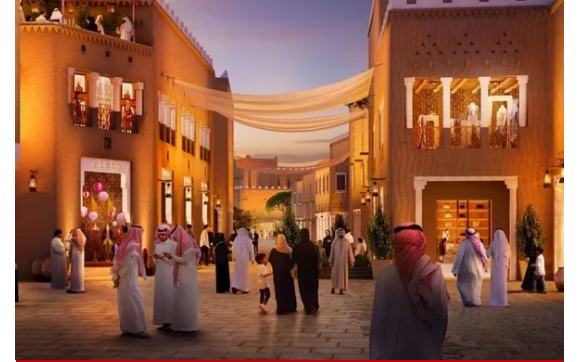
Culture & Tourism