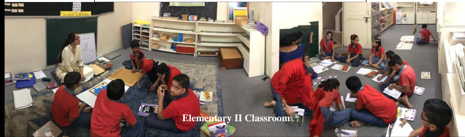
Elementary II Classroom