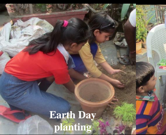
Earth Day planting