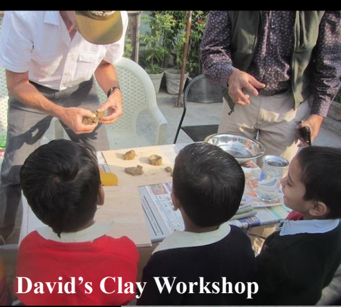
David's Clay Workshop