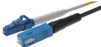
Fusion Splice-On Connector(FSOC)