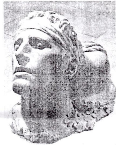
A sculpture by Paul Bronisch. Exhibited in 1941 at an art exhibition in Munich. As with so many "Nazi" art objects it is likely that this sculpture was purposely destroyed by Allied soldiers after the so-called "Liberation".