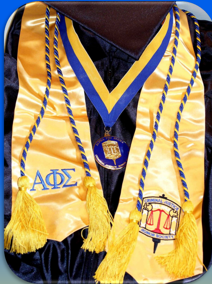
3-Piece Set $76