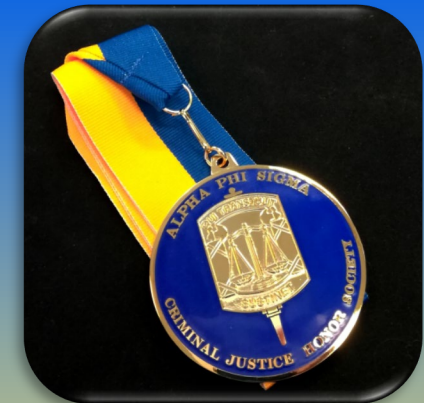
Honor Medallion $25