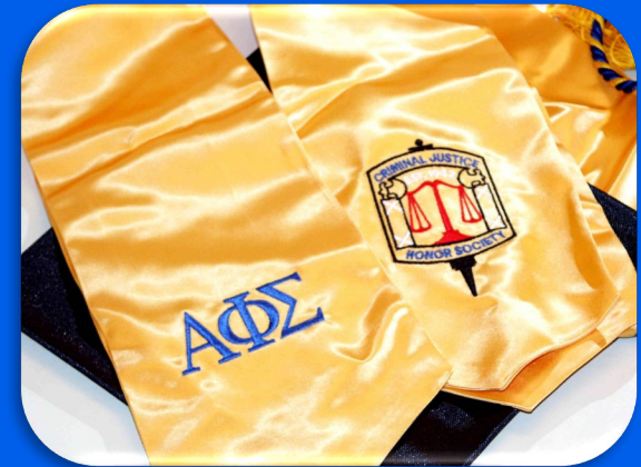
Honor Stole $35