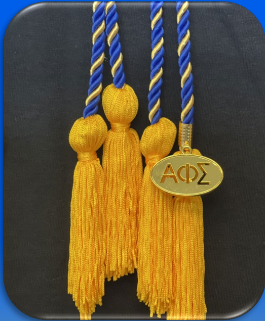
Honor Cords with Greek Letters Charm $20