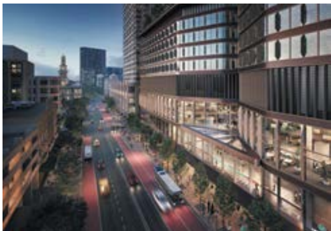
An artist's impression of Pitt Street north station entrance on Park Street, subject to change

Designed by world-renowned architects Foster + Partners, the Pitt Street north building is inspired by its unique park-side CBD context, bringing together office, transport, retail and public places in a coherent form. Its sandstone and bronze colour palette responds to the surrounding context in a contemporary and bespoke manner.