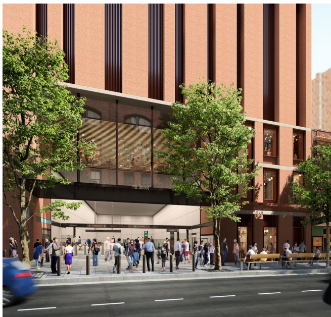
An artist's impression of Pitt Street south station entrance on Bathurst Street, subject to change

The Pitt Street south building is being developed by Oxford Properties Group and constructed by CPB Contractors.