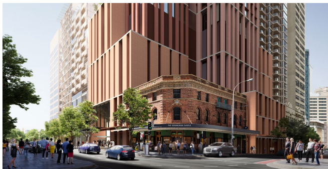
An artist's impression of Pitt Street south at the corner of Pitt and Bathurst streets, subject to change

REGISTER ONLINE TODAY AND HAVE YOUR SAY.