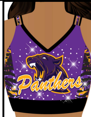
PRACTICE SPORTS BRA