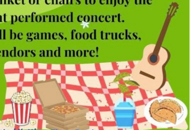
Twisted Kettle Popcorn

Tickets will be sold online between March 1st-20th. Tickets are $10 per student.