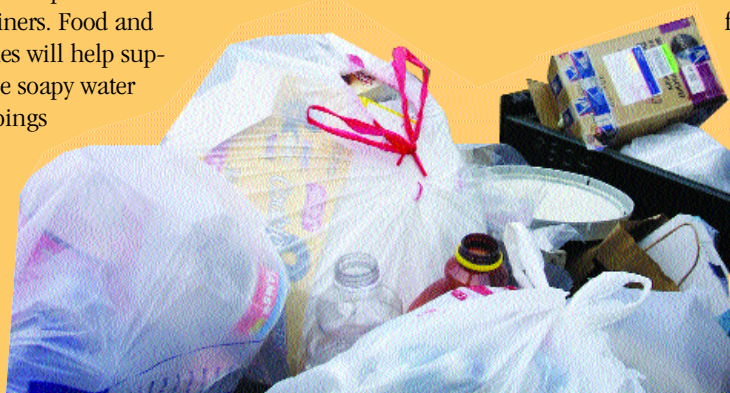
Provide an adequate number of Dumpsters and trash receptacles to avoid content overflow. Outdoor trash receptacles should have self-closing lids.

containers with garbage bags and clean bins weekly with detergent and hot water.