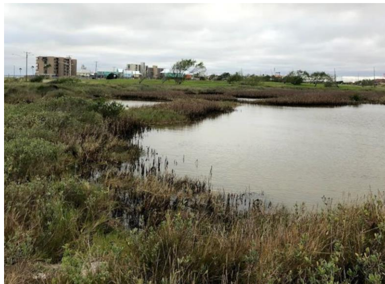
North Beach Eco Park Wetlands

This area has played an important role as a shorebird feeding ground and as a recreational amenity for residents and visitors alike.