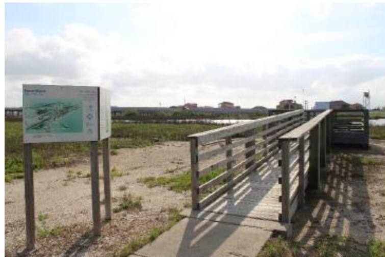
Existing Observation Platform