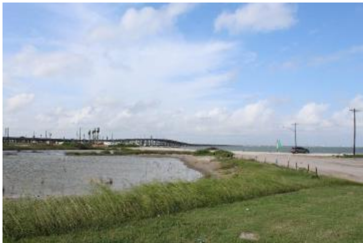
North Beach Eco Park Wetlands and Beach