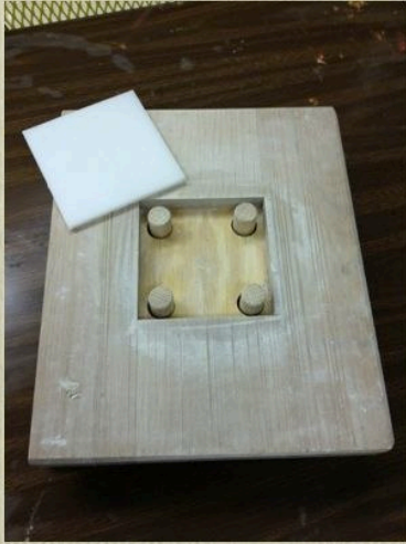
Bill Hunt Tilemaker

To quickly make professional-looking clay tiles!