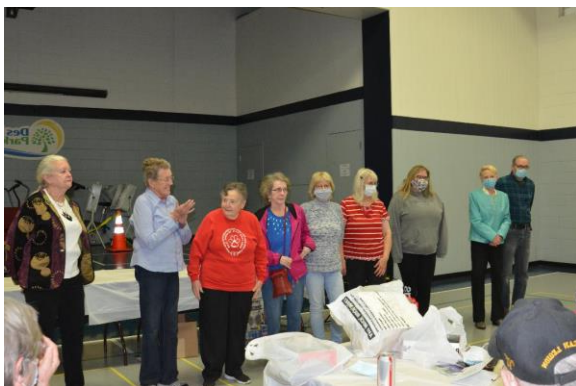
Outgoing Board of Directors