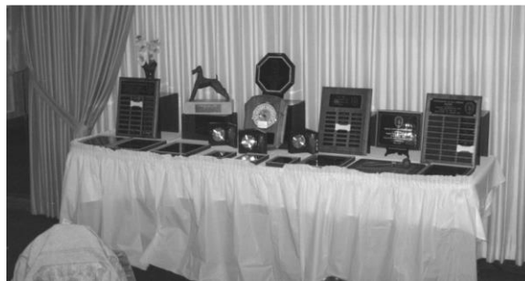
Just a few of the awards presented in past years

It's not too early to think about Rand Park's Annual Awards Banquet Stay tuned for more information!