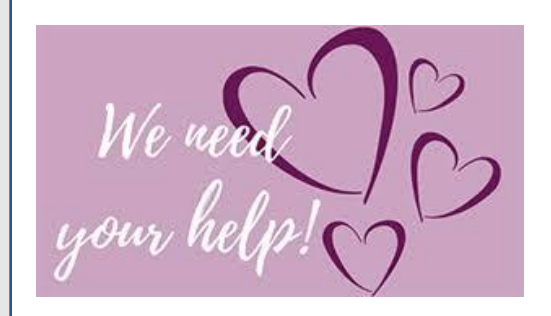
Until then.. our shelf is EMPTY(X)