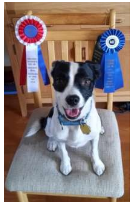
Spartacus with his ribbons

He is now Spartacus CGC CGCA BN CD TKN TKI CA BCAT.