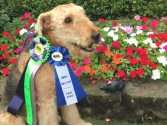
Photo on the left: Scarlet with her high in Class First Place ribbons (If you look very carefully you'll see the rat on the wall facing her.) Photo on the right: Scarlet having just received her 4th "Q"

Scarlet found five rats, did her tunnel and climb in 2:03 minutes (time allotted was 4:30). Scarlet is on a roll. She received her 4th "Q" toward her RATCH and third place in her class. So proud of her! (Note the rat in the picture.) Now she has to sit down and have a talk with her sister, Tara, to motivate her.