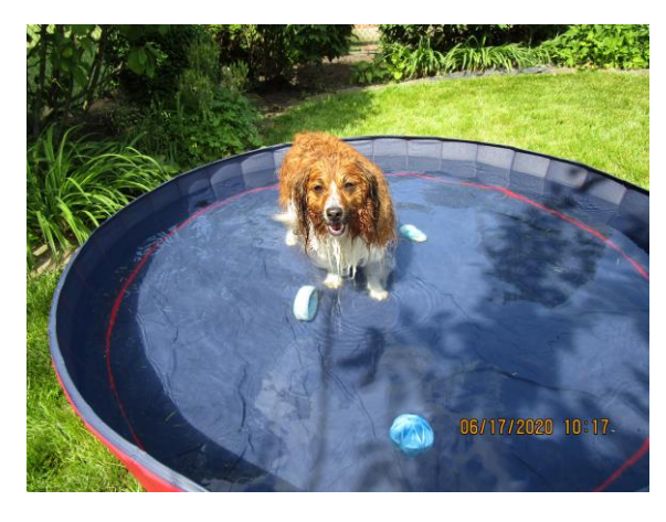
Rizzo enjoying some beach time!