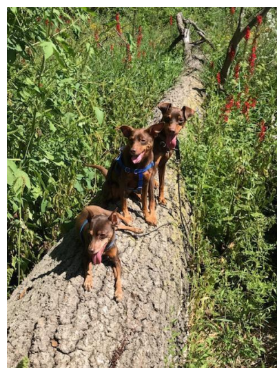
The Three Stooges enjoying their day at Morton Arboretum