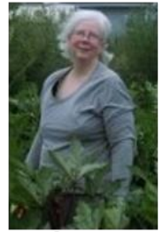
Before New Way of Eating

If you are tired and frustrated with chronic pain, inflammation, headaches, diabetes, high blood pressure, or any number of chronic illnesses, you've got to hear the good news, you, too, can receive this grace. Start 2019 with Hope!