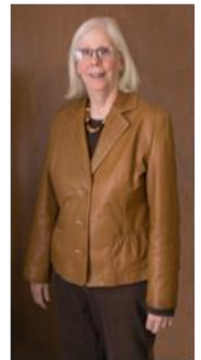
After 65 lbs. weight loss

The cost of this retreat is $200.00 per person. Pay by January 20 and receive $25 discount!