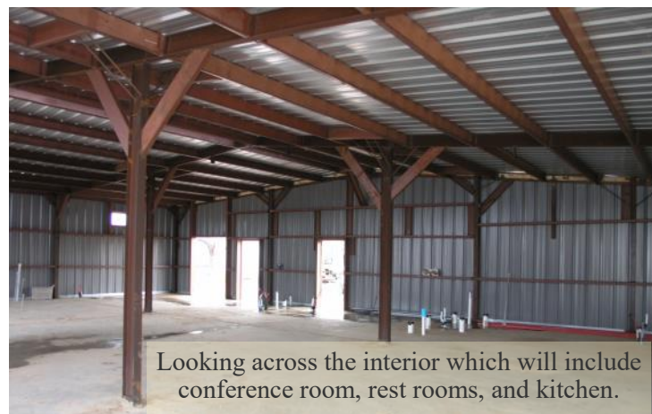
Looking across the interior which will include conference room, rest rooms, and kitchen.