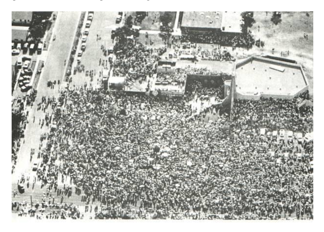
Aerial View; Feast of the Assumption, 1988 of Saint John Neumann Church and some of the 20,000 pilgrims showed up, coming from all parts of the country.

On June 27, 1988 was the first invitation from the Blessed Mother to come to the approaching Feast of the Assumption: "My dear children, the celebration of my Assumption into heaven is approaching quickly. My children, I give you a special invitation to be here; and I ask that you give an invitation to others to join you." The opening of the public media provided the means for the invitation to be quickly sent out across the country. It was reported that over 20,000 pilgrims, coming from all parts of the country, came to Saint John Neumann parish to celebrate that 1988 Feast of the Assumption mass. (see aerial photo of August 15, 1988 event).