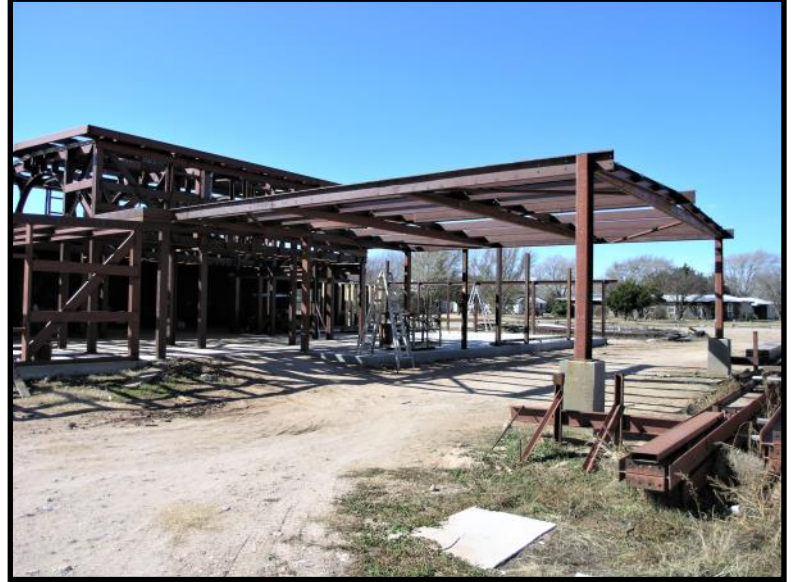
Front of new center which includes car port to protect visitors in bad weather.