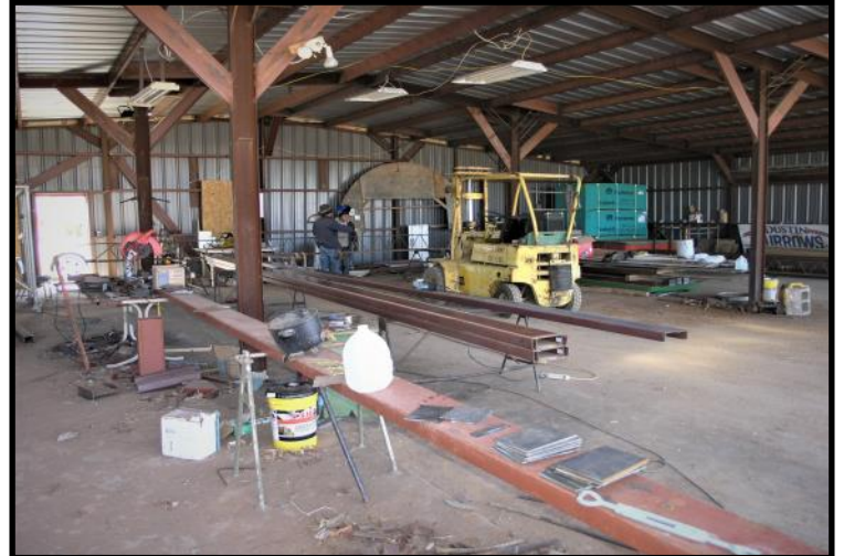
What is to be the kitchen and conference room is temporarily being used as a work area to prepare and cut beams for new Gift Shop and restrooms.