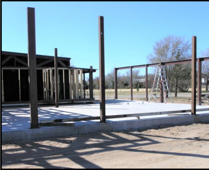
Gift Shop and front restrooms have been poured. Working on the framing and roof.