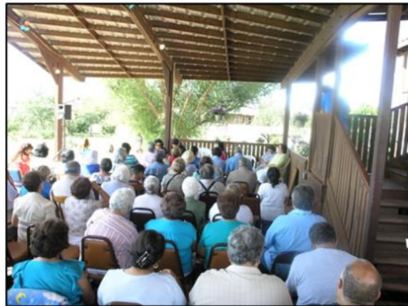
Come join us as we celebrate our Mother's Feast of the Assumption

For more information visit our website at www.flameofmercy.com