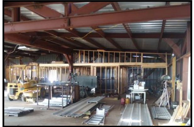
Interior framework beginning!