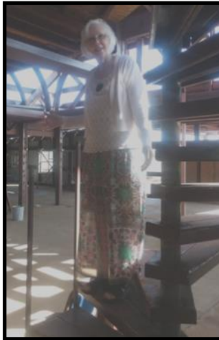
(Above) View of the spiral Stairway to the Choir Loft.