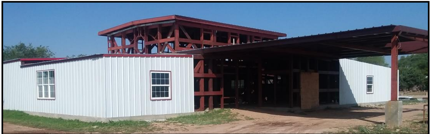
Much of the "skin" of the building is now in place!