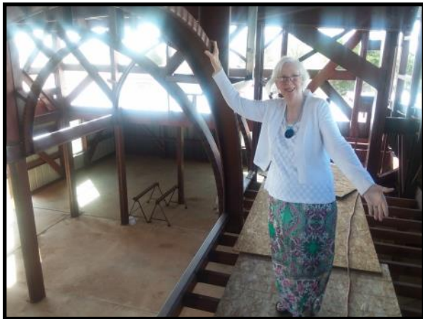
(Above) View of the Choir Loft area.

With God's grace, we are still hoping to hold our first retreat in the building on the weekend of September 4, 2020, which will be the Macho Men of God Retreat. Your financial support is needed to meet this goal. And as always, keep us in your prayers.