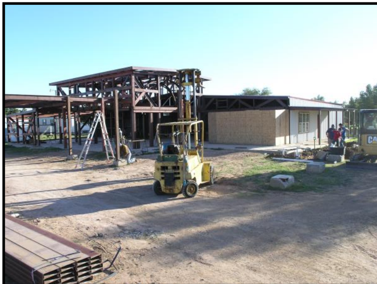
The final sections of the building are coming together. In front of the forklift is where the new Gift Shop will be. To the left side of the picture is the front of the building with the Car Port which will allow retreatants to be protected in times of bad weather. Building is targeted to be finished June 30, 2020.