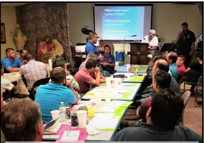
The 89th Macho Men of God Retreat - September 2019

Register today online: www.flameofmercy.com, Email: Admin@fllameofmercy.com, or call the office at 806-832-4243