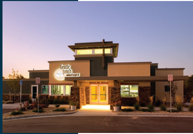
Gentle Touch Animal Hospital

Fitzsimmons Credit Union - Aurora, Colorado $20m | New bank