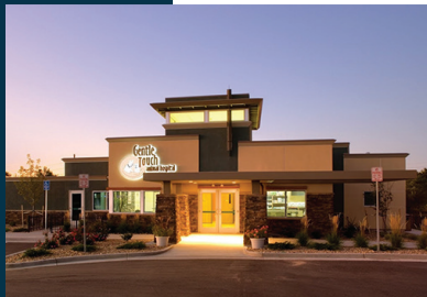
Gentle Touch Animal Hospital

Fitzsimmons Credit Union - Aurora, Colorado $20m | New bank