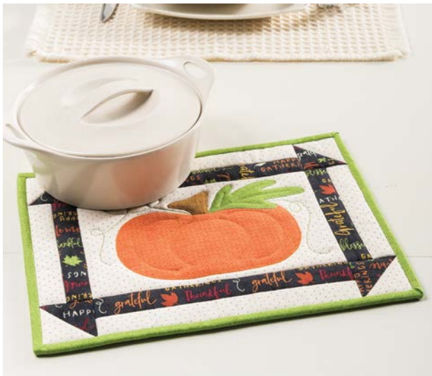
Editorial content subject to change.