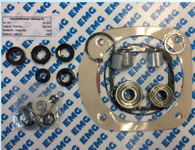
Original wearing parts kit

Keep your ELDROclassic® or ELHY® thruster at the highest performance level using our repair and replacement service!