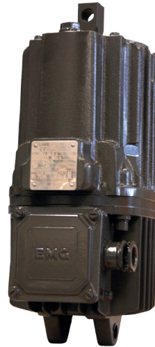
ELDROclassic® AFTER overhauling

Keep your ELDROclassic® or ELHY® thruster at the highest performance level using our repair and replacement service!