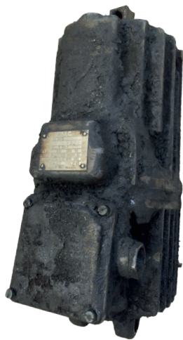
ELDROclassic® BEFORE overhauling