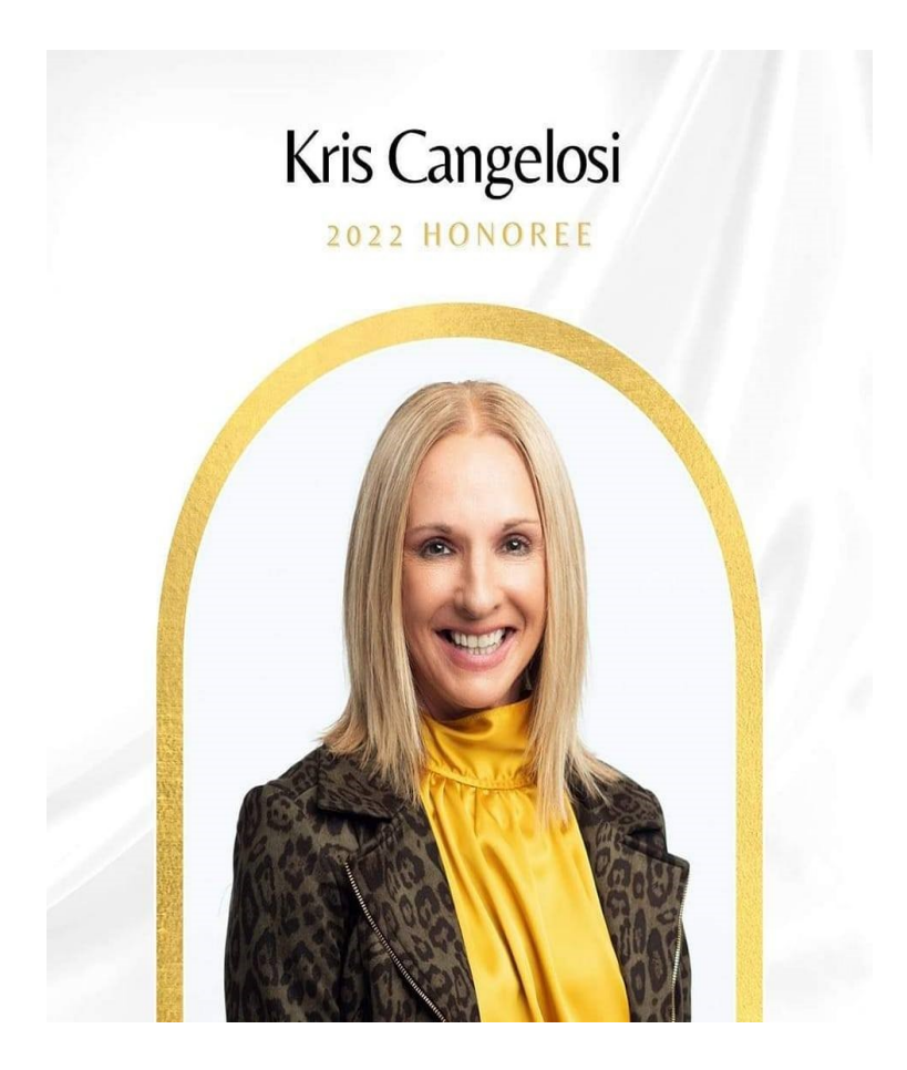
Best Dressed Honoree