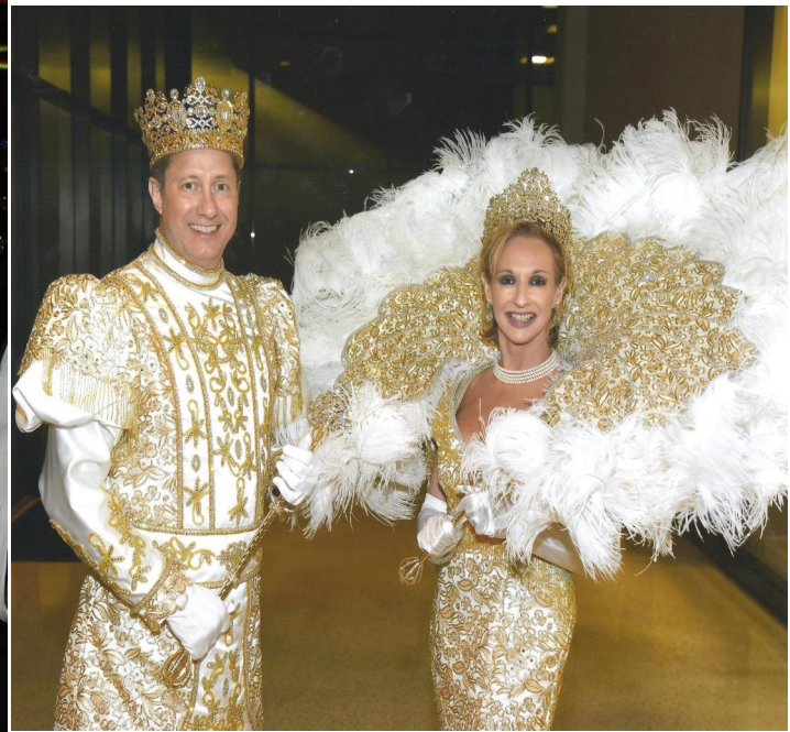
Queen of Artemis