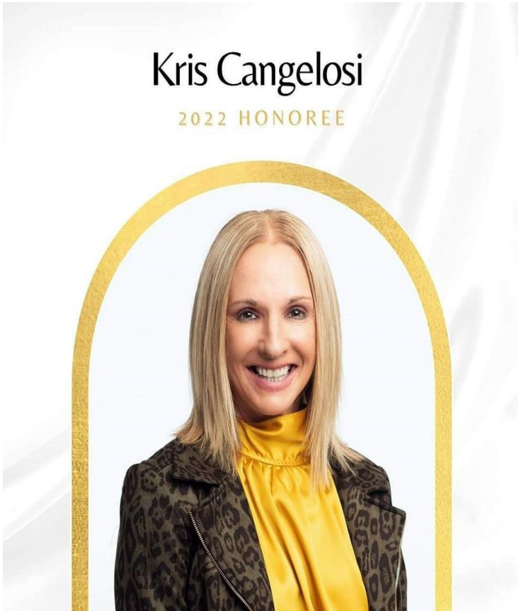
Best Dressed Honoree