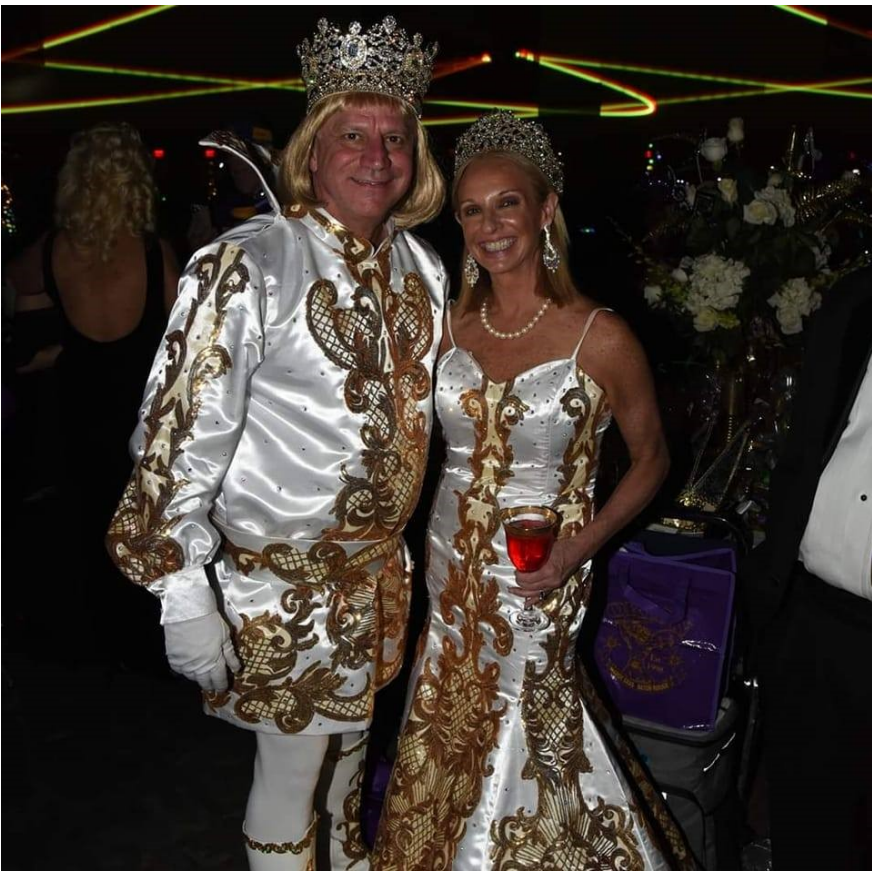
Queen of Orion