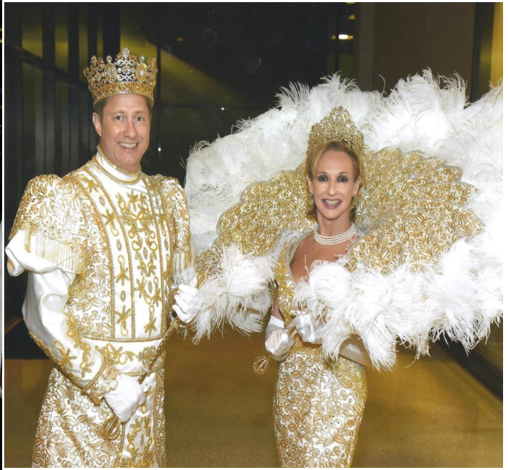
Queen of Artemis