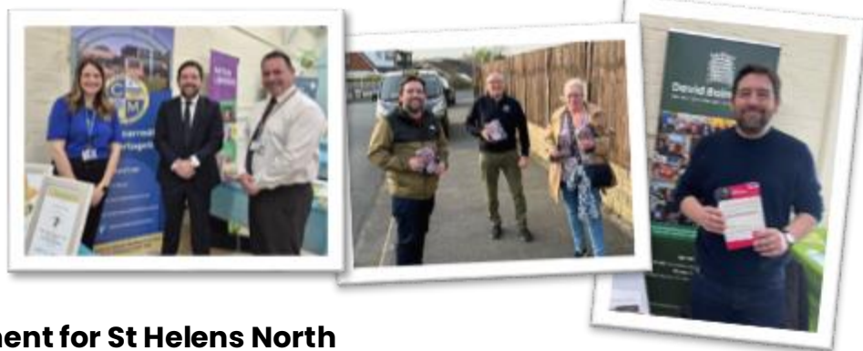
DAVID BAINES MP Labour Member of Parliament for St Helens North