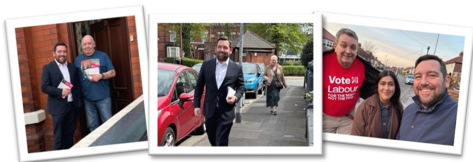
DAVID BAINES MP Labour Member of Parliament for St Helens North