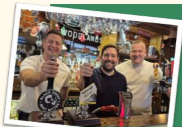
At The Woodlands pub just before Christmas

I am also pleased that lots of the industry has welcomed the new support including the British Beer and Pub Association and Punch Pubs, which operates several well-known and much-loved pubs in St Helens North.