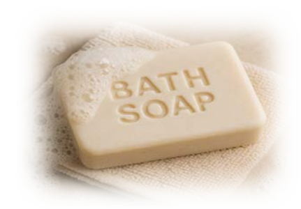
"God Loves a Cheerful Giver"