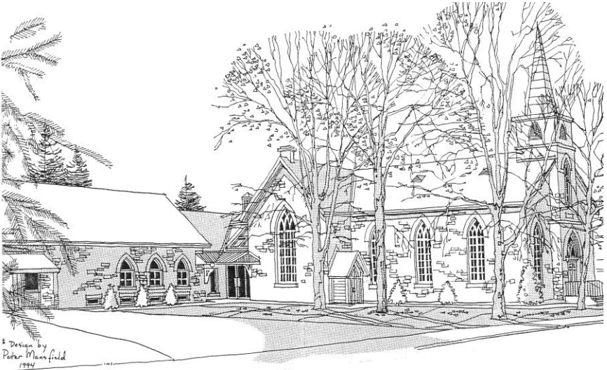
Almonte United Church Sketch by Peter Mansfield