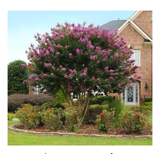
Lagerstroemia 'Crape Myrtle'