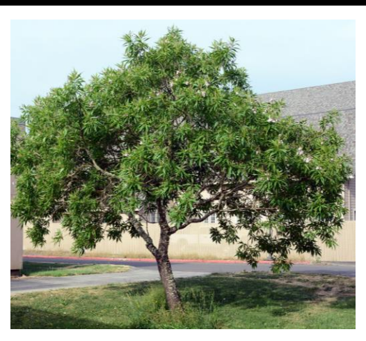
Chitalpa Tashkentensis 'Pink Dawn'