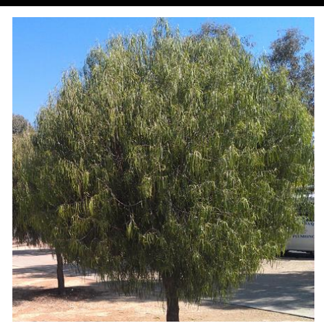
Geijera Parviflora 'Australian Willow'