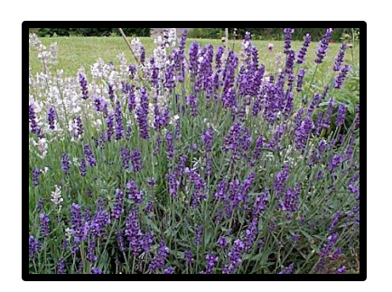
Name: Teucrium Chamaedrys Germander

Has small flowers in dense clusters at stem ends. Stems are 16-20 inches long, may include some leaves. Plant is a semi-woody perennial, classed as a dicotyledon. Leaves and flowers are sweet, aromatic; used in soaps and perfumes.