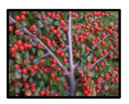
Name: Cotoneaster Species

This is characterized by its dense foliage and ability to spread, providing a seemingly endless blanket of beauty. Boasting beautiful white to pink flowers, the plant blooms predominantly during spring, summer, and autumn. The right location for planting your Myoporum Parvifolium should provide the plant with ample sunlight. This groundcover plant prefers sunny conditions.