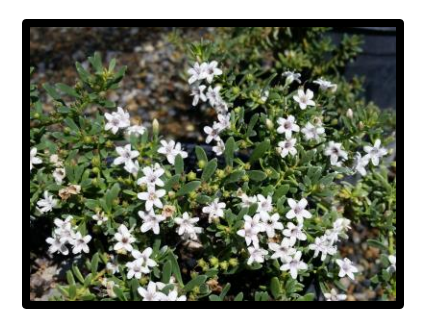
Name: Myoporum Parvifolium

This is a perennial, evergreen subshrub, with woody stems, grayish leaves, and blue to purplish flowers. They prefer full sun and well-drained soils, but some will bloom well in part shade. Once established, most salvia species are quite drought-tolerant and require little care. Excessive water and fertilizer can increase fungal disease problems for salvias. Most salvias prefer slightly acidic soils.