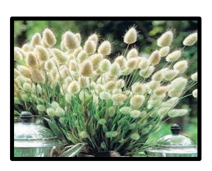
Name: Lagurus Ovatus

Big Muhly is a beautiful ornamental grass. With its stunning appearance and low-maintenance nature, Big Muhly is a popular choice. It is a clumping grass that can grow up to 6 feet tall and wide, making it a great option for adding height and texture to landscapes. This plant must be fully maintained and kept to a size reasonable for front yard use.