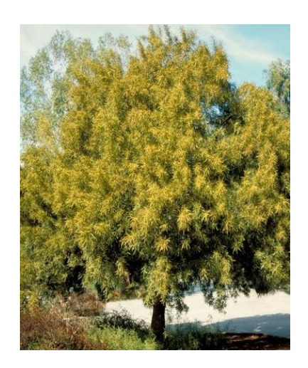
Rhus Lancea 'African Sumac'