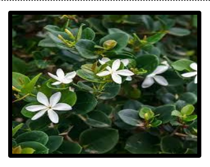
Name: Cotoneaster Dammeri