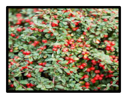
Name: Prostrate Acacia

Green Carpet Natal Plum has attractive dark green evergreen foliage which emerges coppery-bronze in spring on a plant with a spreading habit of growth. The glossy round leaves are highly ornamental and remain dark green throughout the winter. It features dainty white star-shaped flowers along the branches from early spring to late fall.