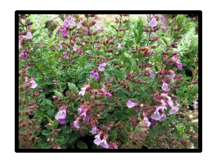
Name: Ligustrum Japonica 'Texanum'

It grows 6-18 inches tall with a 1-2 foot spread. In late spring to summer, magenta-pink tubular flowers grow in whorls from the leaf axils and are attractive to bees. The leaves are aromatic and shiny with scalloped edges. The horizontal and ascending stems form an attractive mound.