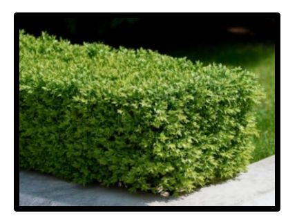
Name: Lantana Montevidensis

Plant in sun or shade. Water deeply twice weekly for 2 to 3 months after planting. Once established, boxwoods are drought tolerant. However, a deep watering once weekly during periods of drought, including during the winter, will encourage better growth and health. Must be maintained to not overgrow.