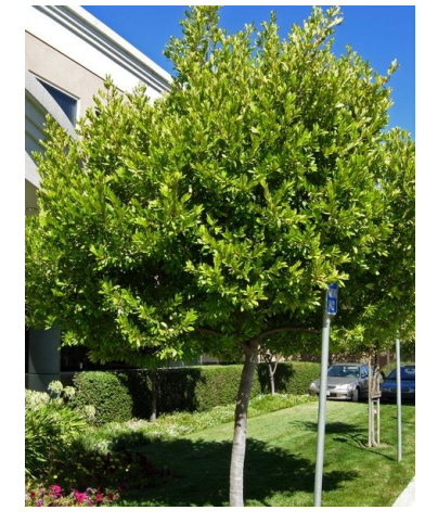
Prunus Caroliniana 'Carolina Laurelcherry'

EVERY YARD MUST RETAIN ONE FRONT YARD TREE UNLESS OTHERWISE APPROVED BY THE ARC.