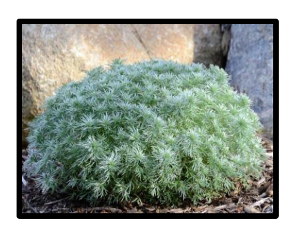
Name: Buxus sempervirens