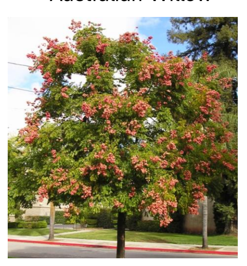
Koelreuteria Bipinnata 'Chinese Flame Tree'