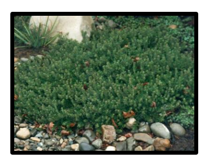
Name: Lavandula Spp Lavender