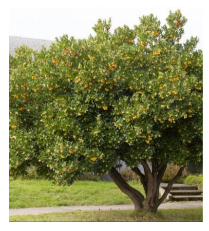
Arbutus Unedo, 'Strawberry Tree'