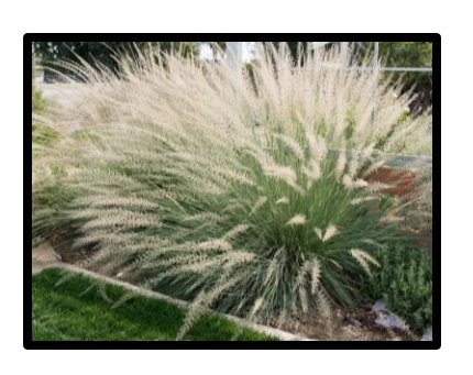
Name: Muhlenbergia Lindheimeri Muhly Grass

It produces fan-shaped clumps of iris-like, narrow, sword-shaped, basal, evergreen leaves. Flowers appear on branched stalks Each flower (to 2"wide) has three light yellow tepals with dark brown blotches at the bases and three petal-like staminoids that lack blotches. Each flower stalk carries a large supply of buds. Flowering occurs in bloom bursts that often occur at 2 week intervals. Plants generally grow to 2'tall.