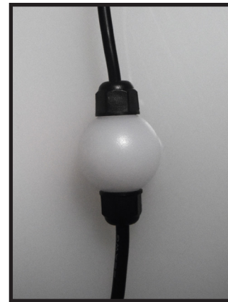
Minleon-Rainmin's RGB+Trik28 is a smaller option to the popular RGB+Trik42.

Specifications as of April 2018 and are subject to change.