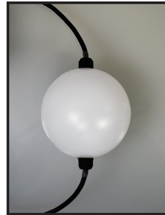
TrikiLit 100's (RGB+Triki100), have 4x the LED's & draw 4x as much power as the G42 & G28 TrikiLits.

Specifications as of April 2018 and are subject to change.