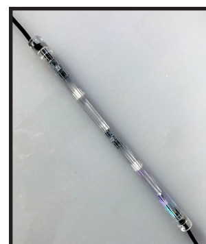
RGB+T5 Light Tubes, fluted style, refract light similar to a prism.

Specifications as of April 2018 and are subject to change.