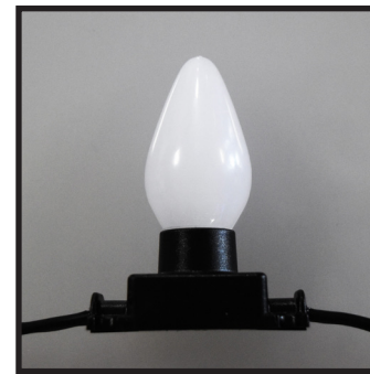
The RGB+C7 is one of many shapes available, and can be frosted or faceted.

Specifications as of April 2018 and are subject to change.