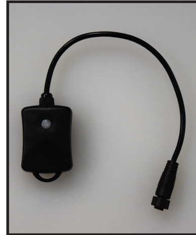
Minleon-Rainmin's WEC+ drives small & mid-size animated displays.

Specifications as of May 2018 and are subject to change.