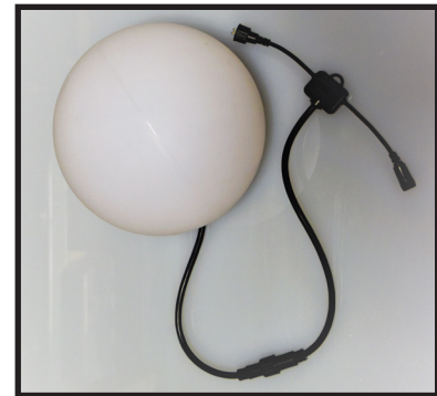
RGB+S250 Sphere. Also referred to as RGB Globe or Orb.

Specifications as of July 2018 and are subject to change.