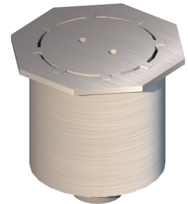
4 SUMP PERSPECTIVE Scale: Not to Scale

*SUMPS ALSO AVAILABLE IN VARIOUS DIAMETERS AND DEPTHS, AND WITH OPTIONAL SCREEN BASKETS WITH VARIOUS PERCENTAGES OF PERFORATIONS