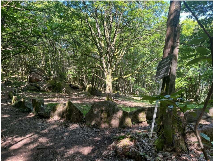
Figure 5: The Cromlech (stone circle)

Puy. Great views from here and a tradition to climb the rock & have a photo taken! You can also take a picnic and drinks (but there are no bins)