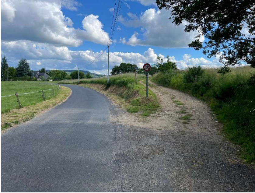
Figure 1: Bear right

2. At the small fork in the road, just past Le Passadou, take the path to the right.