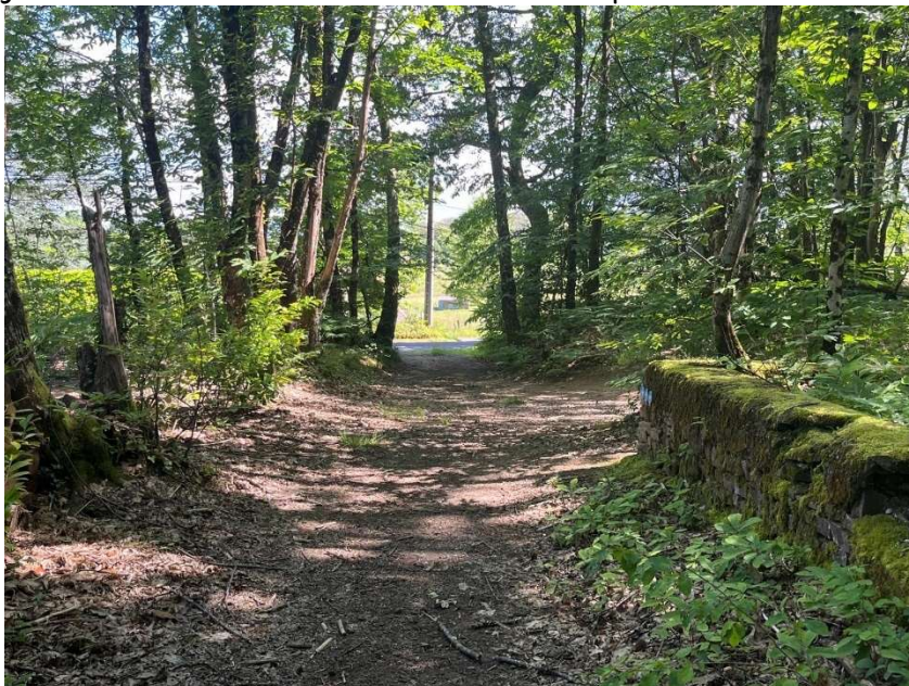
Figure 14: Turn right at the cabin in the woods

9. Eventually you come to a cabin in the woods on your left and you're taking the path to your right past the little pond. You can just about see our roof on this path!