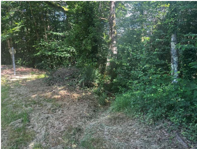
Figure 12: Take the better-defined path on the right

At the house on the left (look for a white plastic chair 😊)..take the path on the right (look for the one that is the most defined).