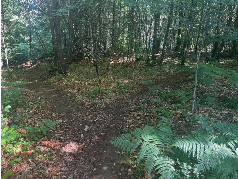
Figure 13: Keep right

Keep right and head to the cabin in the woods ...should keep the white chair house directly behind you.