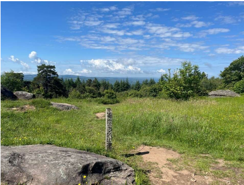
Figure 8: Path down to the Ermitage