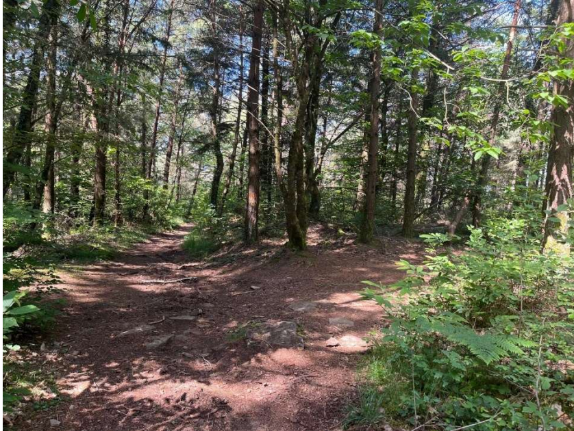
Figure 11: Turn right here (straight on takes you down into Aubazine)

8. At the fork, take the right turn and follow this until the house on your left and you turn right following the path.