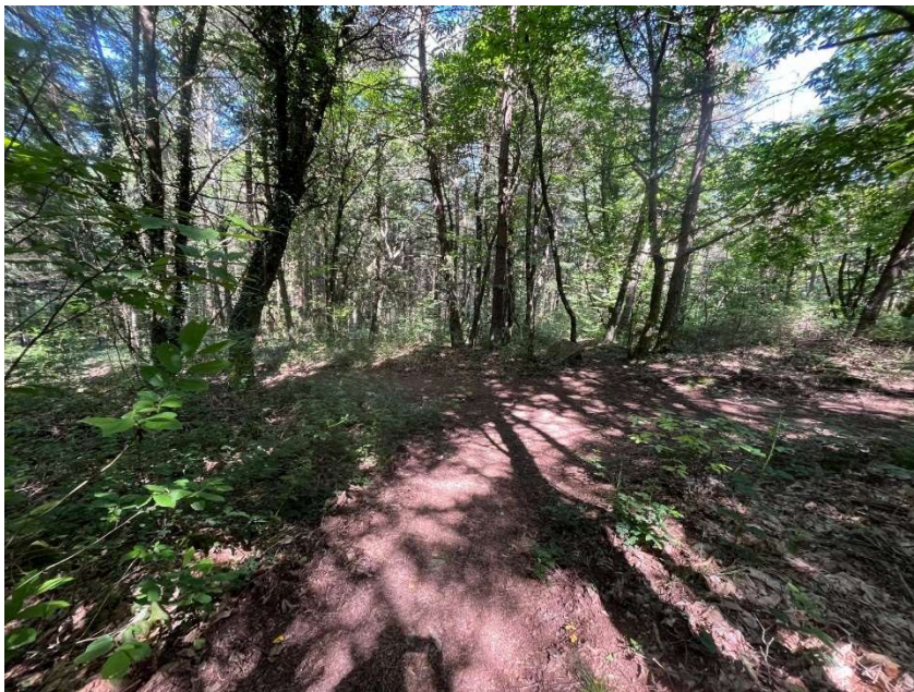
Figure 10: Turn left and head down the hill (right brings you back to the path you used to get to the Puy from the Cromlech)