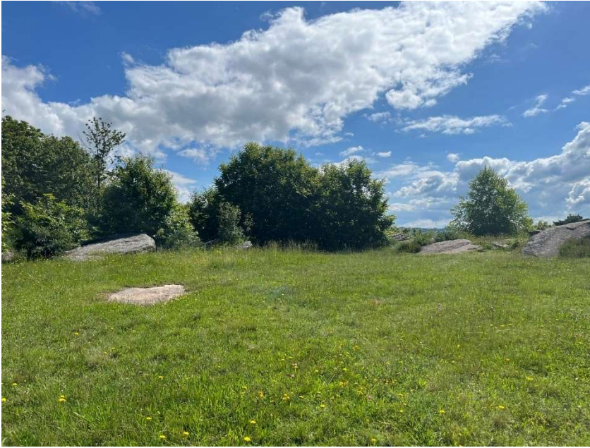
Figure 7: Path down to the Quarry

straight opposite to retrace your steps back home.