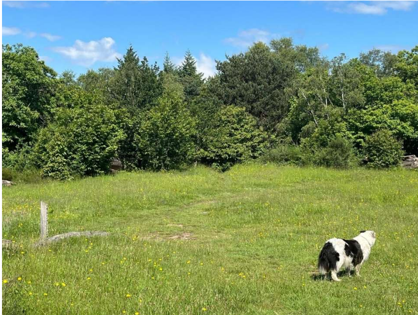
Figure 9: Slightly longer route back home

7. OR you can come down the 2nd path on your left. Follow the path down & to the left.