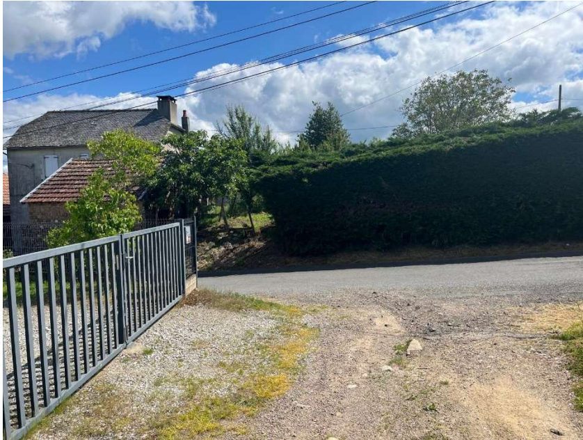
Figure 15: Turn left back into the village

10. It brings you back to the Rue de Mardil. Turn left and our house is on the left at the bottom of the hill