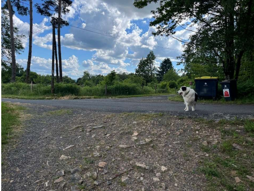
Figure 3: Turn right for this walk (straight on takes you to the Ermitage and left towards the Dolmen)

4. For the Puy, turn right and then first right again up a small path (this junction is left for Le Dolmen and La Chapelle / Le canal des moines. And straight for the quarry & Hermitage)