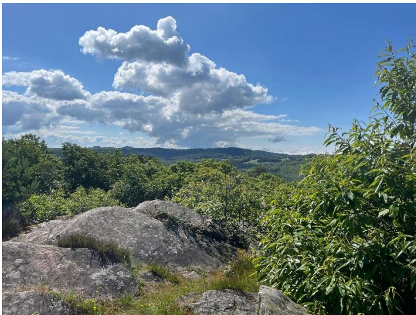
Figure 6: The Puy (enjoy the views)

6. You can come down the same route or, with your back to the view, take the right path to the quarry. Follow the path down & read some of the display boards. Then turn left onto the path which will bring you back to the crossroads and you're going