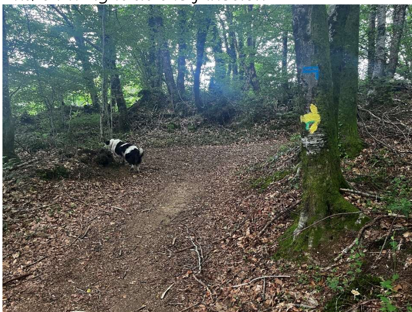
Figure 16: Turn right

Ending up back at the crossroads (step 6) where you turn left and then retrace your steps back to the wooden chalet and turn right and go back the same way to Pauliac.