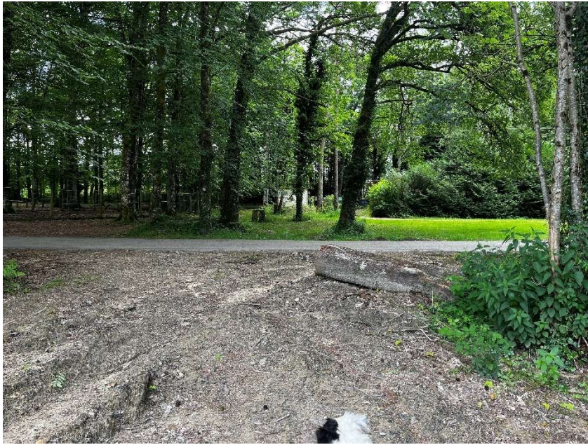
Figure 11: Head straight over the road and then turn left at the "No Motor Vehicles Barrier"