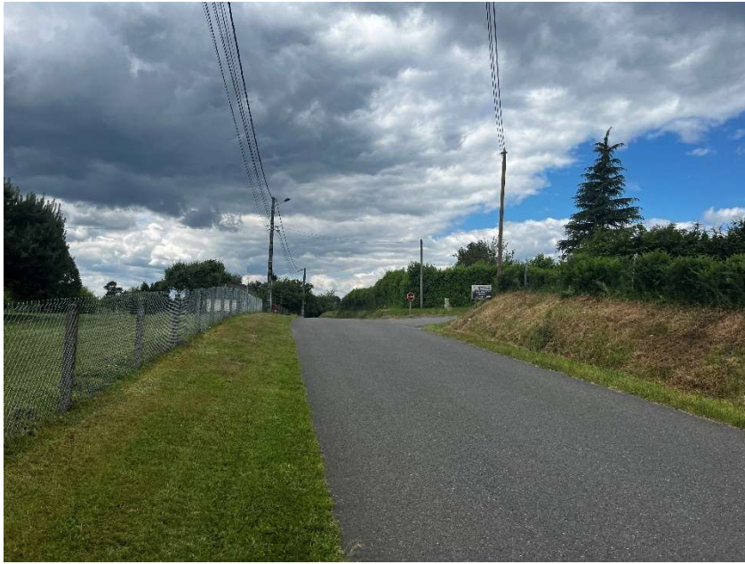
Figure 19: Turn right