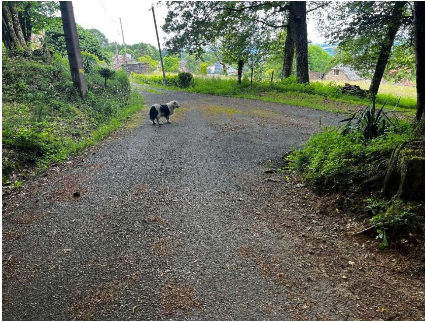
Figure 9: Turn right

10. Bear right and stay on this path until you reach a road (you will see the entrance to the Camping Campéole Le Coiroux camp site on your right, turning left here takes you up to the golf club.)