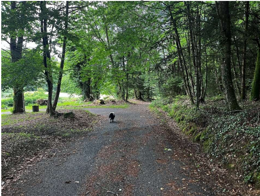
Figure 10: Bear right and stay on this path until you reach the road to the golf club

10. Bear right and stay on this path until you reach a road (you will see the entrance to the Camping Campéole Le Coiroux camp site on your right, turning left here takes you up to the golf club.)