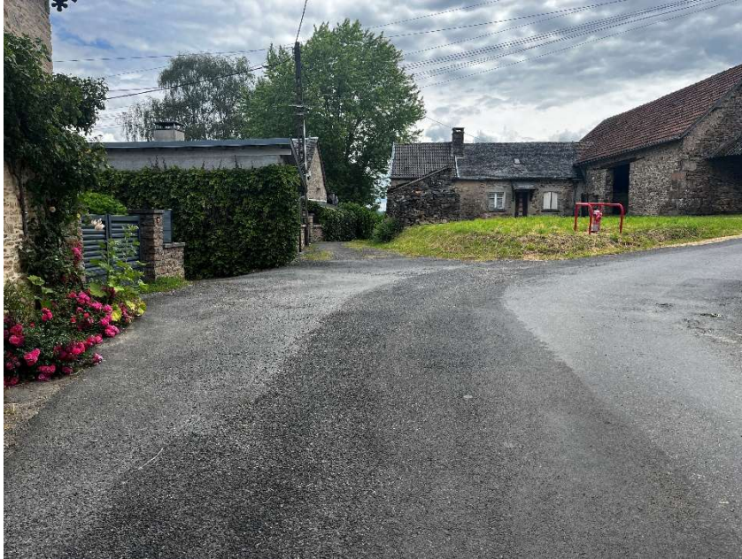
Figure 1: Head between the buildings

1. Turn right out of the house and rather than head up the road, turn left down the little lane between the houses.