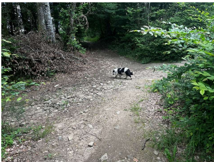
Figure 17: Turn left and head back to the 4 routes crossroads