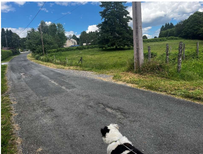
Figure 20: Turn right and head back to Pauliac

12. It's a good couple of hours, more with a drink stop or time at the beach