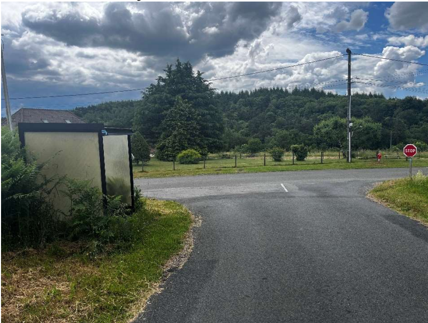
Figure 6: Turn left

5. Turn left and then at the T-junction turn left and head towards the 4 routes T-junction.