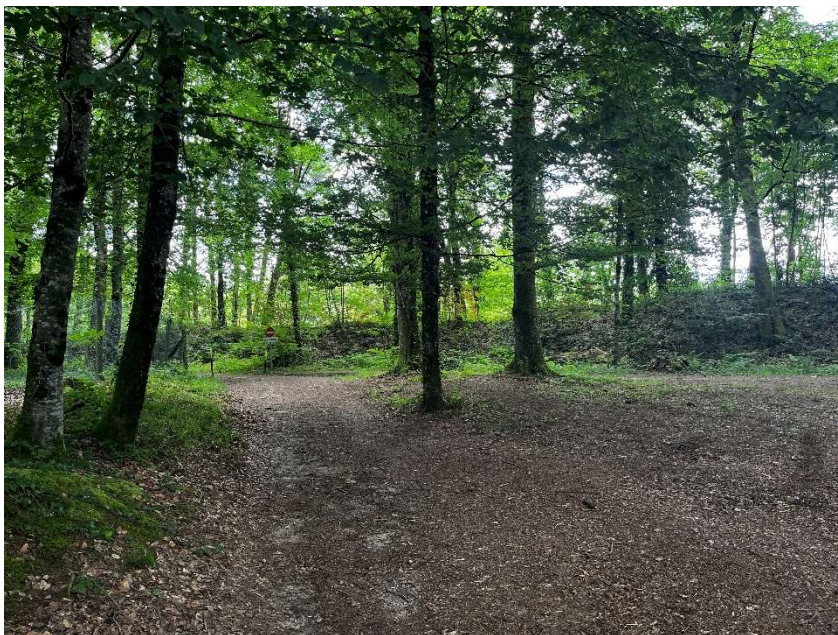
Figure 12: Turn left and follow around the crazy golf to the lake

12. From the beach, retrace your steps around the crazy golf and where you turned left, head straight over the road and follow the path to the next junction.