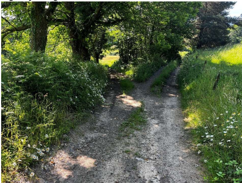
Figure 4: Bear left

3. Stay on this main path bearing left at the first junction (going right just goes into a field).