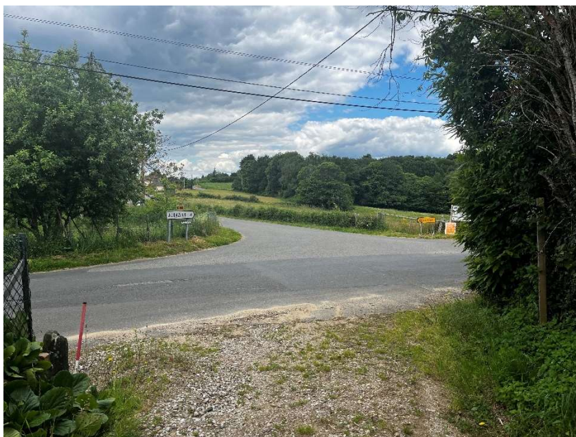
Figure 18: Straight over