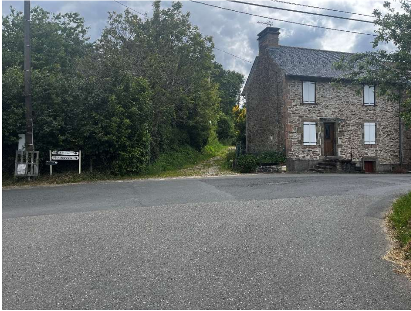
Figure 7: Straight on towards the lake

6. Here we head straight over signposted Lac du Coiroux.