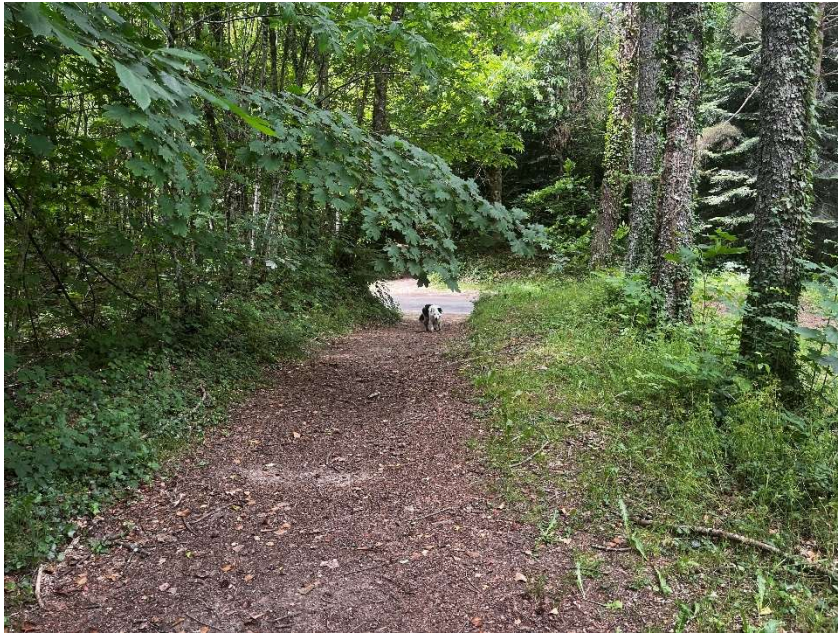
Figure 13: Head straight over the road

13. You have a choice here, straight takes you back to the crossroads step 6, or to extend turn left eventually arriving back to the crossroads in step 6.