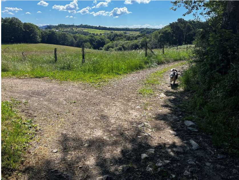
Figure 3: Bear slightly right

..and then at the junction bear slightly right (turning left just takes you around the village)