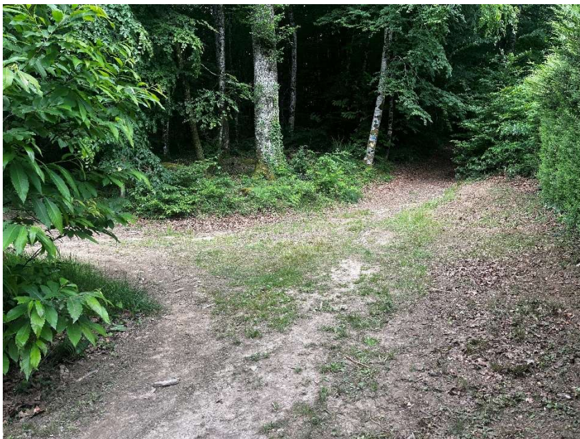
Figure 14: Turn left to extend walk or straight on to head back towards the 4 routes crossroad (step 6)

13. You have a choice here, straight takes you back to the crossroads step 6, or to extend turn left eventually arriving back to the crossroads in step 6.