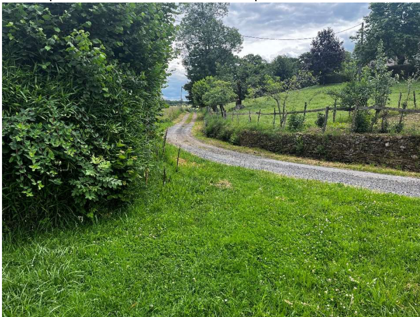
Figure 2: Bear left onto the track