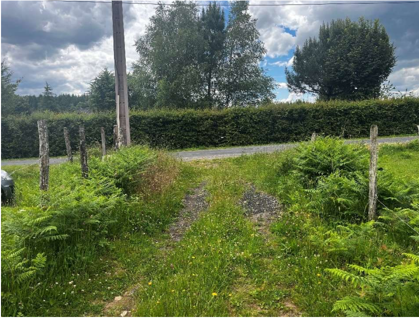
Figure 5: Turn left (chalet on your left)

5. Turn left and then at the T-junction turn left and head towards the 4 routes T-junction.