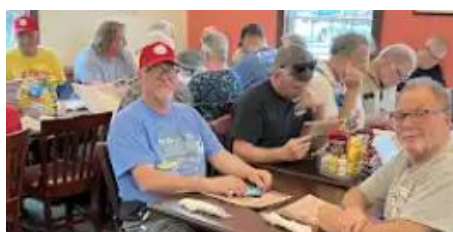
What better way to end a day on the Salvage yard tour than with a meal and car conversation?

Almost as important as the salvage yard we visit is the restaurant where