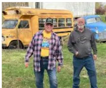
Members head into the salvage yard to "hunt"!

March 29 th saw 29 KYANA members and 7 guests attend this year's KYANA salvage yard tour. We returned to Dave's Auto Salvage in Milan, Indiana, northwest of Louisville. We last visited Dave's about a dozen years ago. We found some older vehicles gone, possibly lost to the mobile crusher man. On the other hand, there were quite a few new additions, both for vehicles and our attendees. With the advance of time, what were once relatively late model vehicles have now moved into the collectible realm.