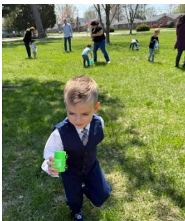
The hunt is on!