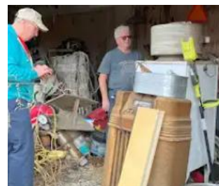
Members admire an early refrigerator, one of the non-automotive treasures that found a home.

For every attendee who found an automotive-related treasure at Dave's, an equal number found non-automotive treasures. Several members planned return visits to get items they were not prepared to remove and transport the day of our visit.