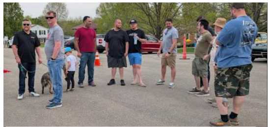
KYANA members made sure to greet attendees