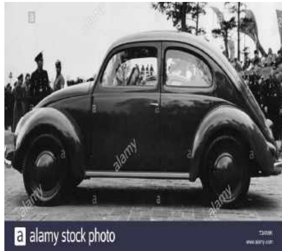
1938 Volkswagen , a close copy and very successful famous Beetle, a long-produced automobile