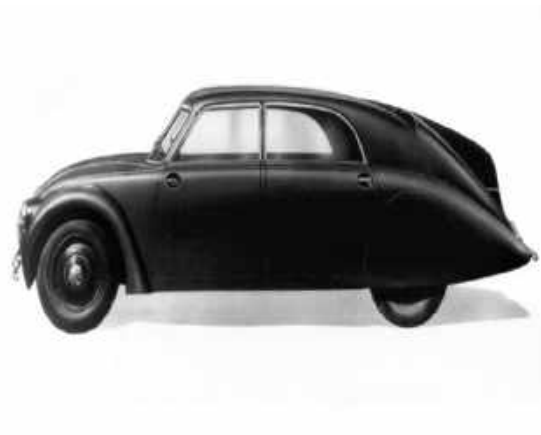
Later Tetra, a streamlined production vehicle