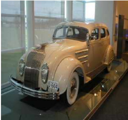
1934 Chrysler Airflow