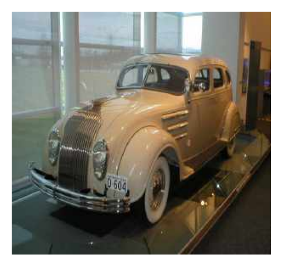
1934 Chrysler Airflow