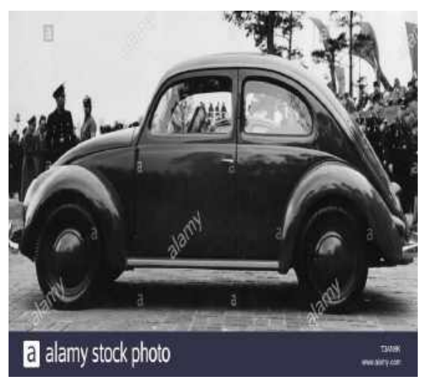
1938 Volkswagen , a close copy and very successful famous Beetle, a long-produced automobile