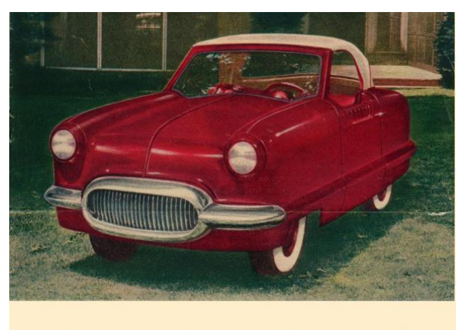
NXI Prototype vehicle